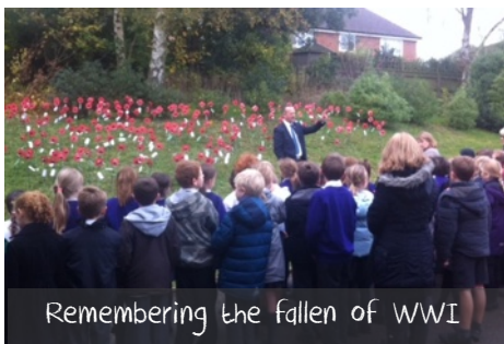
Remembering the fallen of WWI

As we always do we marked the 11th day of the 11th month. Of course this year was particularly poignant, being the centenary year of the start of World War I. We made poppies to create our own 'poppy installation' and reflected on the immense sacrifices that were made by the brave soldiers in the Great War.